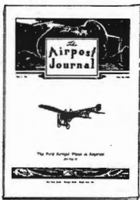
● The Cover of Vol. I, No. 1 of The Airpost Journal