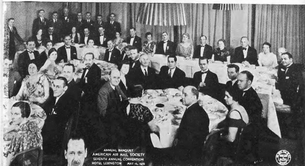
ANNUAL BANQUET AMERICAN AIR MAIL SOCIETY SEVENTH ANNUAL CONVENTION HOTEL LEXINGTON MAY 15, 1936