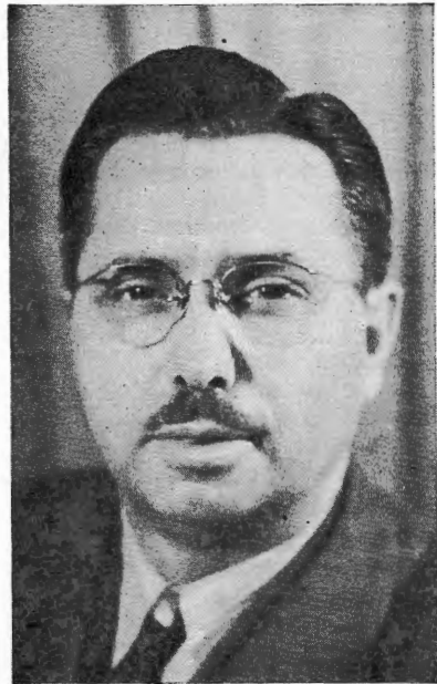
● Treasurer Warns