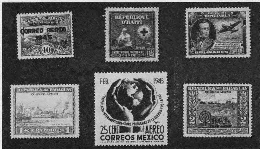
—Stamps for Illustration Courtesy F. W. Kessler ● Some of the Recent Air Mail Stamp Issues